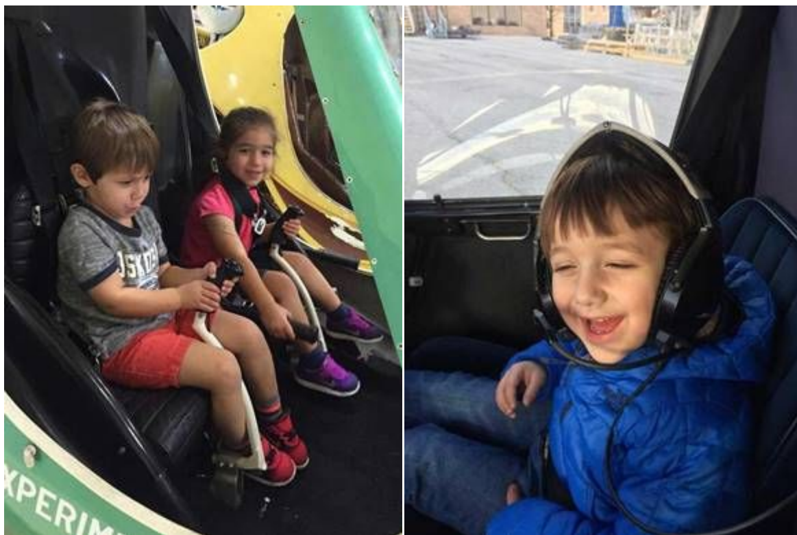
The lil Sigman's really enjoying themselves!