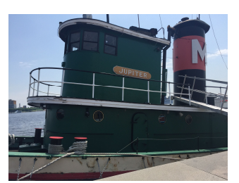
more about her story at

There's a piece of local Auxiliary history docked alongside at Penn's Landing, and if you have an opportunity to see her-Please do. She was once a vital part of service to our area. You can learn