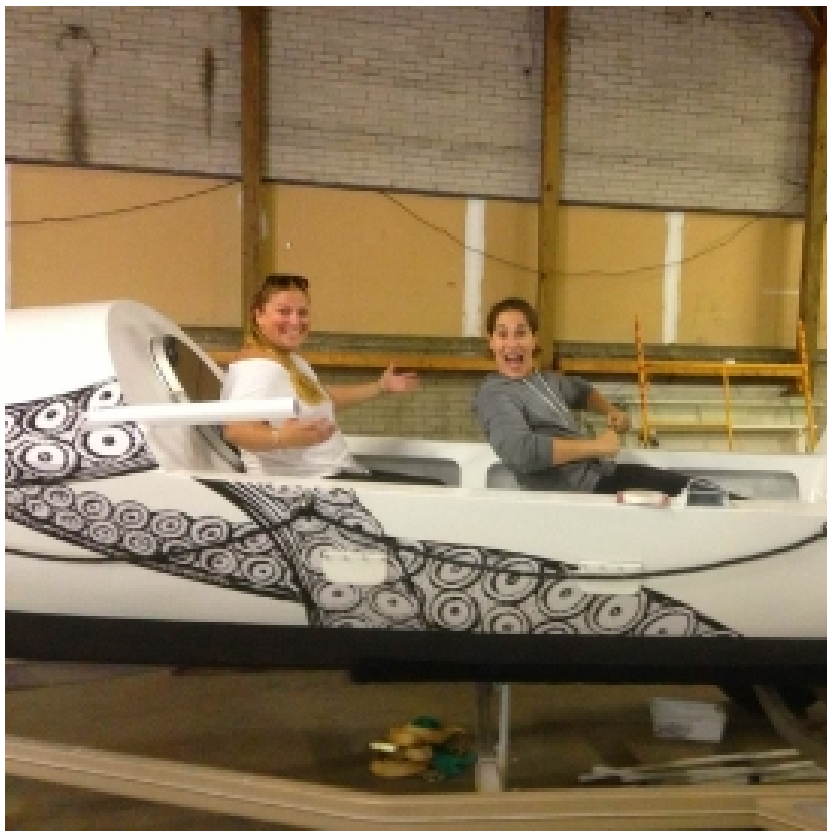
Both rowers "hamming" it up!