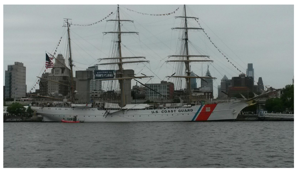
The Eagle prepares for her next voyage.