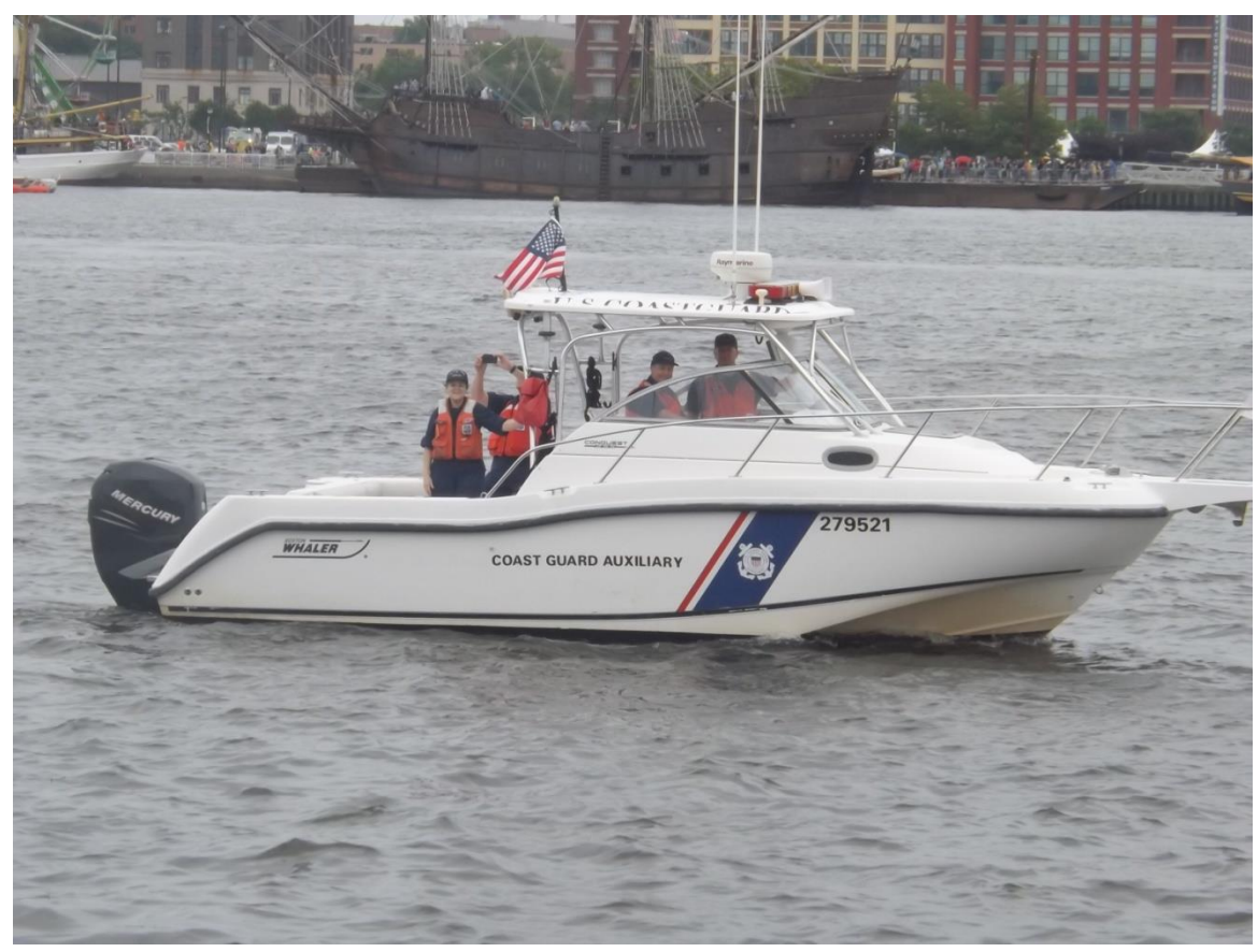
USCG AUX members on patrol along the Delaware River. Kudos!