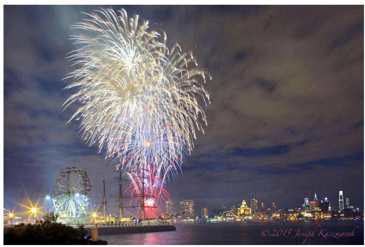
The Grand Final-Thanks for visiting Philadelphia!!