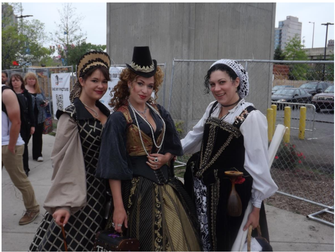
Period actors treated visitors with historical banter of tales of ole.