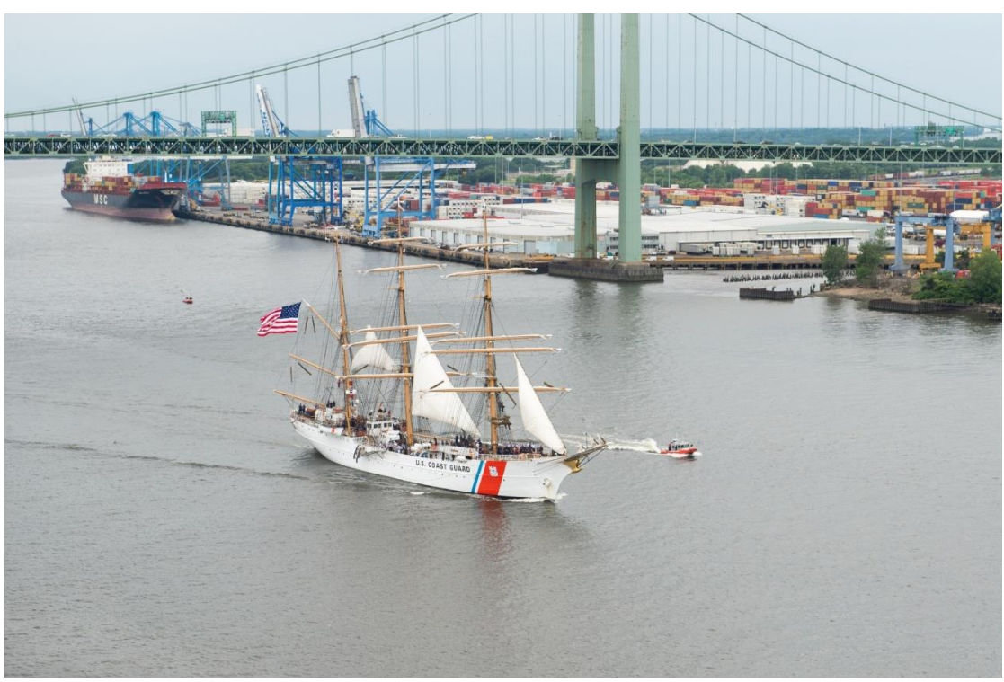
USCGC Eagle sailing up the Delaware