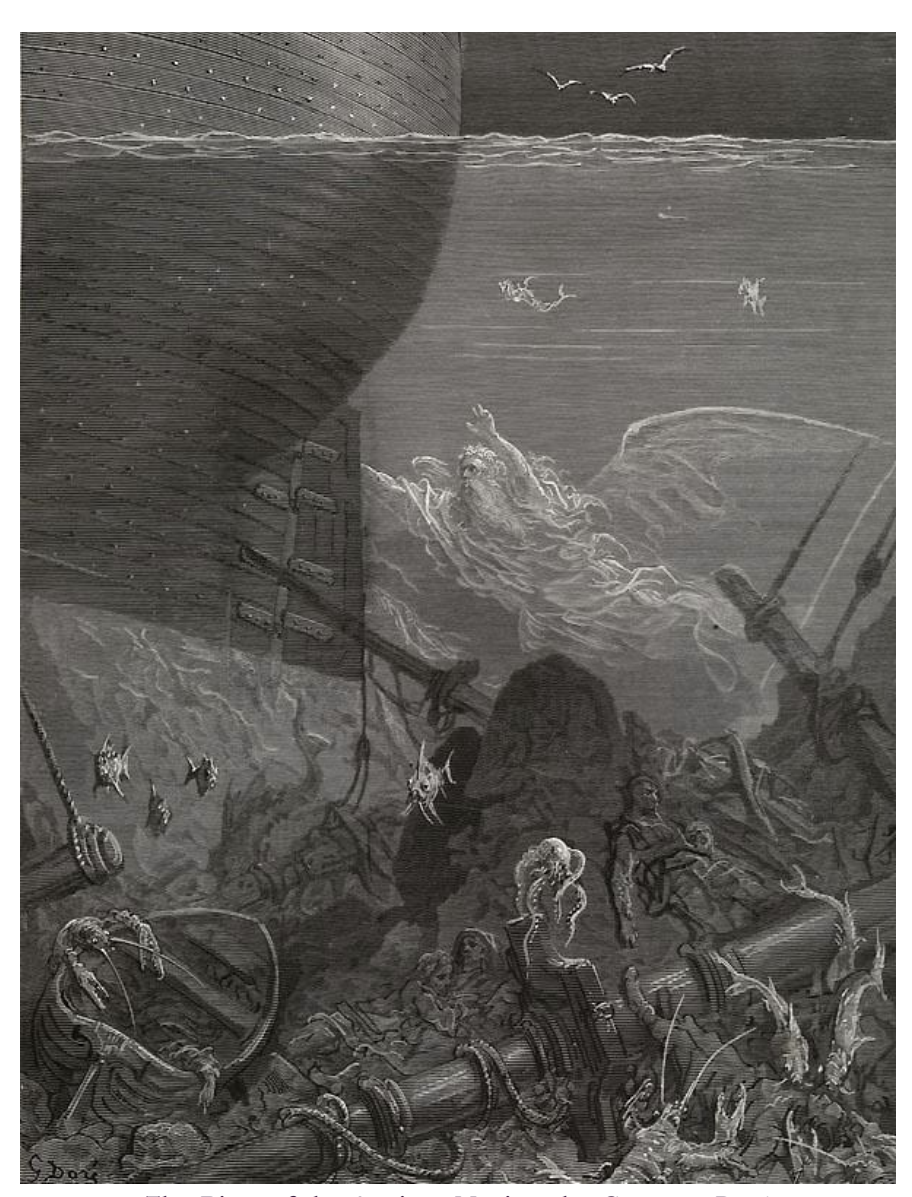
The Rime of the Ancient Mariner by Gustave Doré

September 2012 Vol. 37 No. 9 Newsletter of the U.S. Coast Guard Auxiliary Flotilla 2-76 5NR