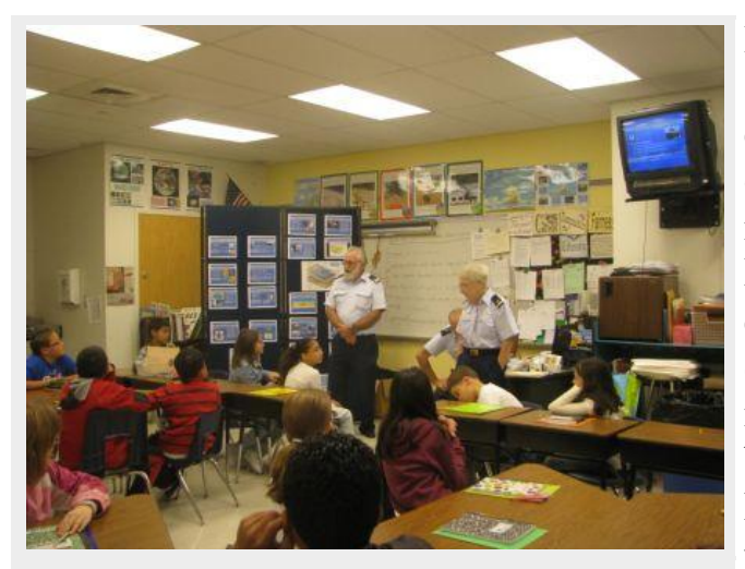
Auxiliary instructors fielding questions from the students.

long did it take to clean up the Gulf spill? Why are the oceans salty? Why do oil-absorbing materials only absorb oil and not water?" And many, many more similar probing questions. In tribute to the school system, they displayed a good understanding of earth's history of how oceans and land masses shifted and changed over billions of years.