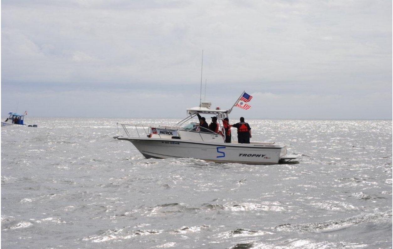
Ken's Vessel "Principal Distraction" - Delaware Bay - Safety Vessel during the MRO Event.

Auxiliary boat crew patrols remained active during September (final full month of patrols).